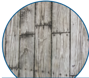
Cracked Wood & Plaster